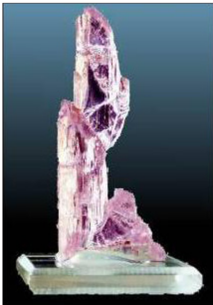
Spodumene, Galileia, Brazil