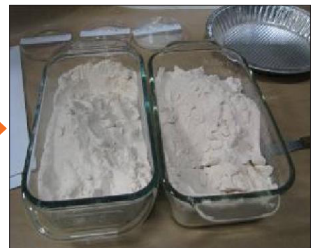
After Acid Roasted Concentrate