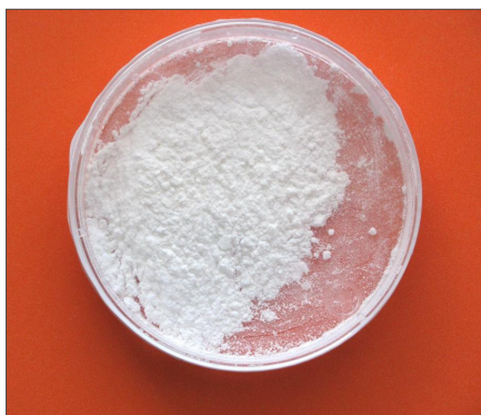
A sample of high grade lithium carbonate